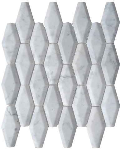
MM99-28 Santa Monica