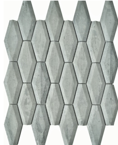
MM99-52 Portuguese Bend